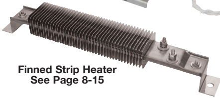
Finned Strip Heater See Page 8-15