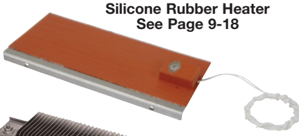
Silicone Rubber Heater See Page 9-18