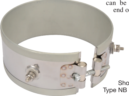
Shown with Type NB Built-In Strap

can be used where band heaters can be slipped over the end of the cylinder.