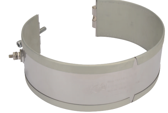
Shown with Type NE Built-In Strap