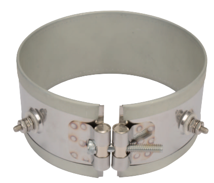
Type NB Shown