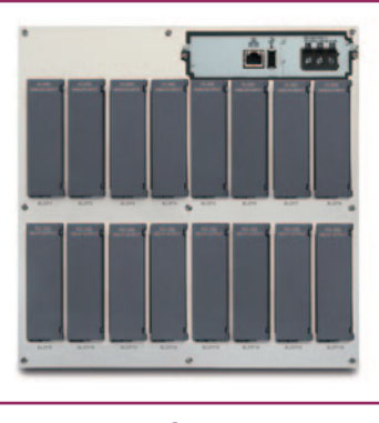
PPS-3000 16 slots, up to 48 Analog inputs