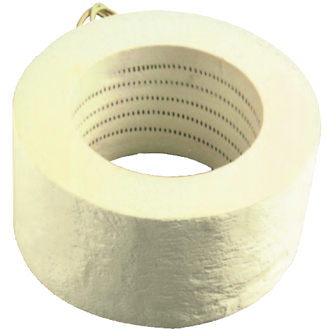
Standard Full Cylindrical Shaped Heater 8" I.D. × 12" O.D. × 6" Long