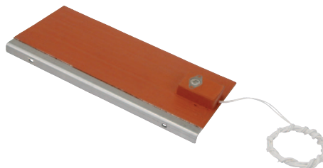
Silicone Rubber Heater See Page 9-18