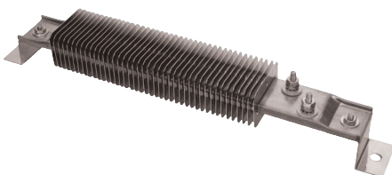
Finned Strip Heater See Page 8-14